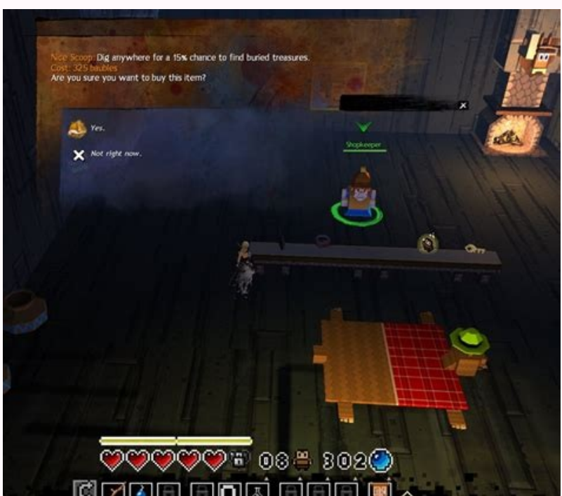
Gw2 crafting legendary weapons. Gw2 legendary weapons crafting guide. Gw2 legendary weapon crafting requirements. Gw2 legendary crafting.